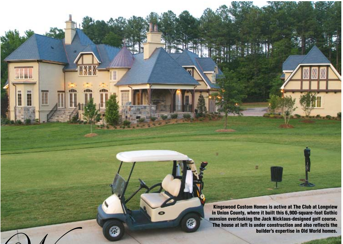
Kingswood Custom Homes is active at The Club at Longview in Union County, where it built this 6,900-square-foot Gothic mansion overlooking the Jack Nicklaus-designed golf course. The house at left is under construction and also reflects the builder's expertise in Old World homes.